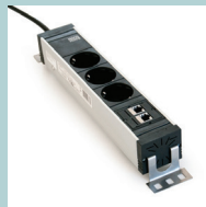
Power socket blocks