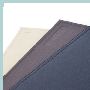
Leather table mats